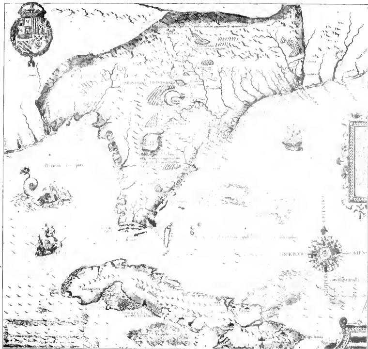
"FLORIDÆ AMERICANÆ PROVINCIÆ RECENS & EXACTISSIMA DESCRIPTIO," BY JACQUES LE MOINE ET AL. LAGUES, PUBLISHED BY DE BRY IN 1591